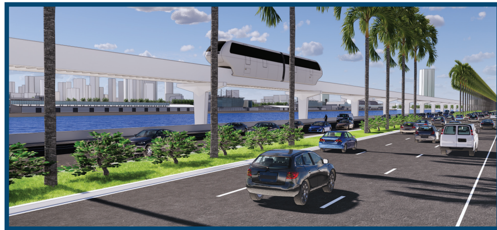
Rendering of Elevated Rubber Tire Transit on the Bay Crossing/Trunkline

The Miami Beach Extension on Washington Avenue will require further analysis and approval by the Florida Department of Transportation and City of Miami Beach before it can be designed and constructed.