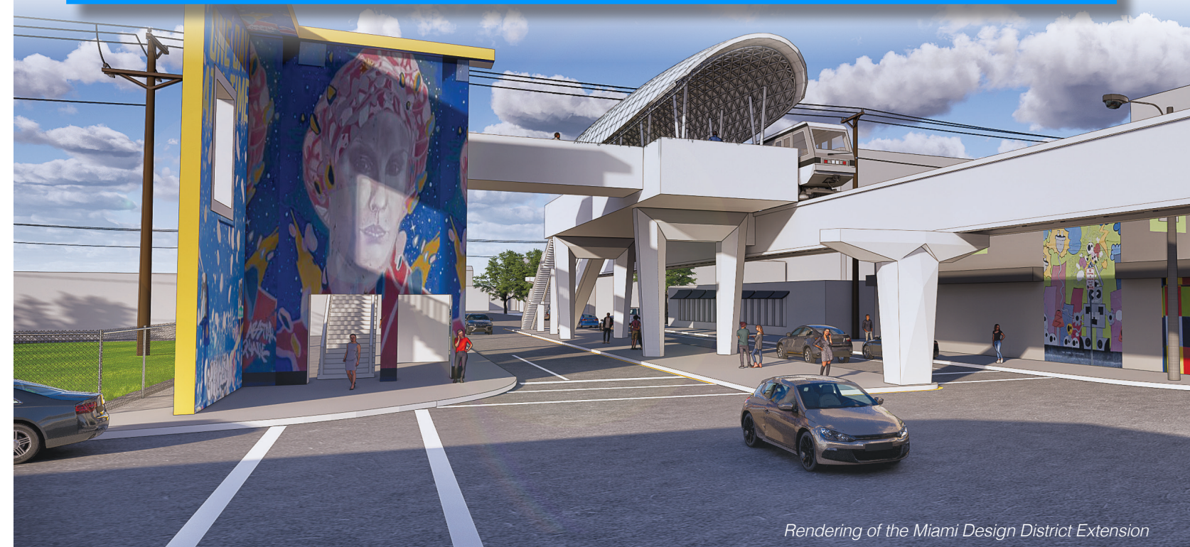
Rendering of the Miami Design District Extension