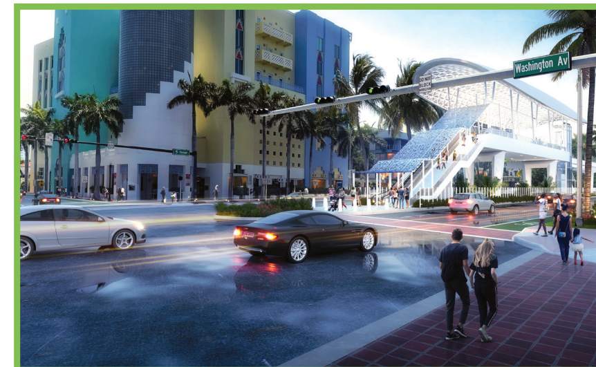
Rendering of Transit Station at 5th Street and Washington Avenue

The Project Development and Environment (PD&E) Study for the Beach Corridor Rapid Transit Project is a study of rapid transit options to connect the Miami Design District/Midtown to Downtown Miami and Miami Beach. The Beach Corridor is one of the five rapid transit corridors in the Strategic Miami Area Rapid Transit (SMART) Program and the study is being conducted by the Miami-Dade County Department of Transportation and Public Works (DTPW) and funded by both DTPW and the Florida Department of Transportation (FDOT).